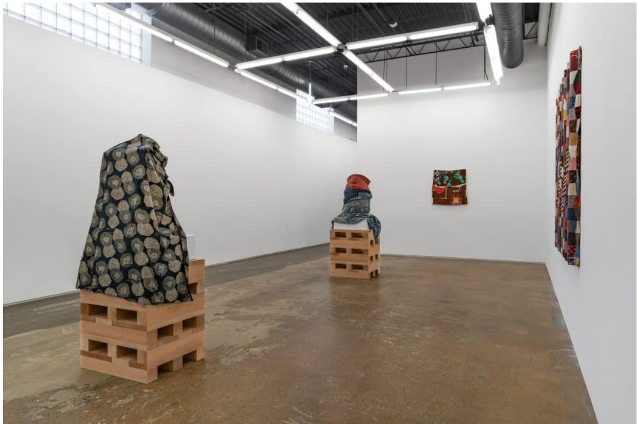
Sanford Biggers, installation view of "Back to the Stars"

Sanford Biggers' exhibition "Back to the Stars," currently on view at moniquemeloche, is an opportunity to relish in the unwavering longevity, challenging interrogation, and persevering inspiration of the artist's career. Biggers' fourth solo exhibition at the gallery includes eight new works that further represent his skillful ability to marry sublime craftsmanship, an undeniable eye for composition, and energizing probes of social and cultural conversations.