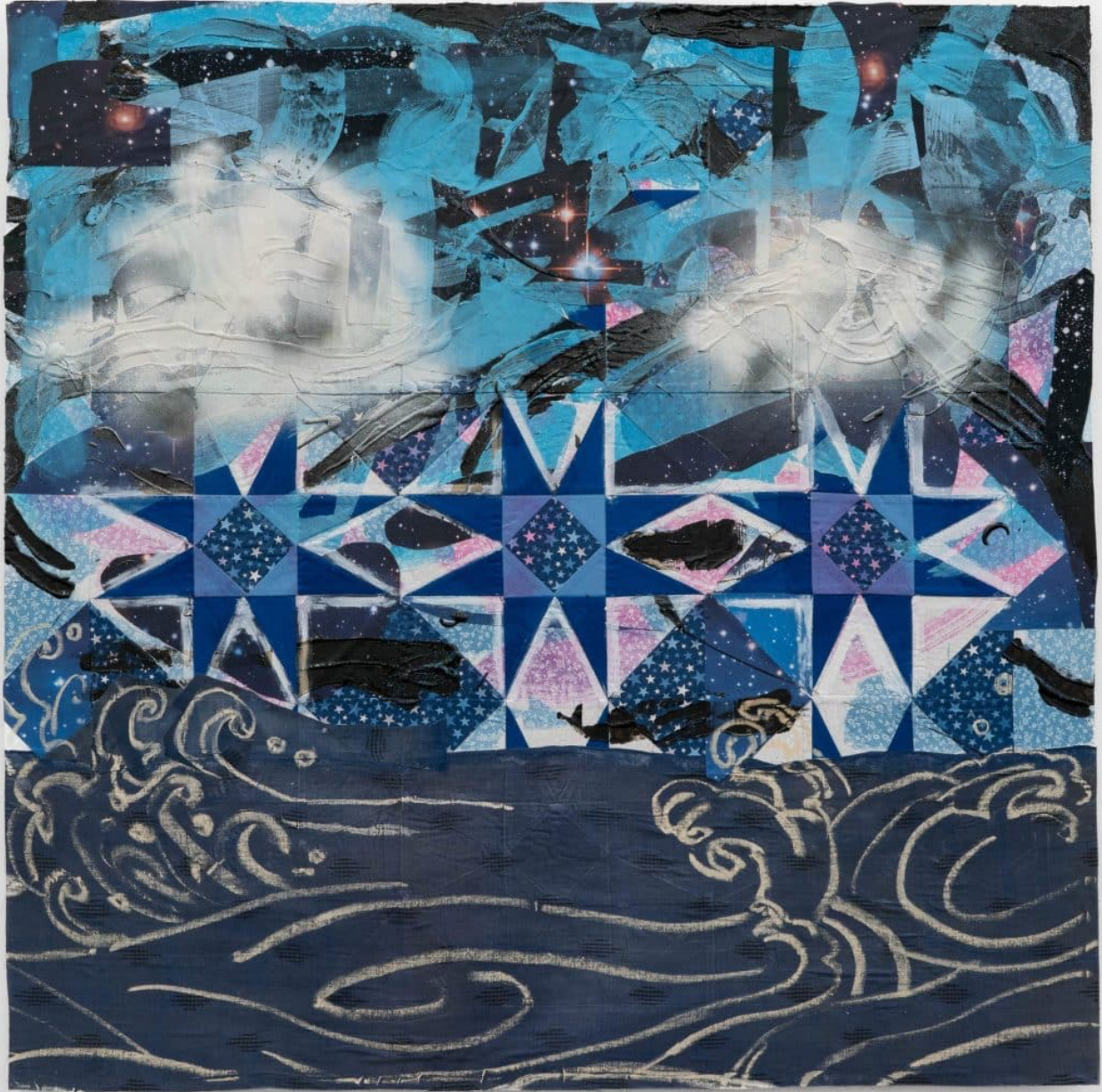
Sanford Biggers, "Voyage to Atlantis," 2023, antique quilt, assorted textiles, mixed media mounted on felt, 42" x 41 3/4" x 1 3/8"

The two sculptures are positioned to face each other, offering a camaraderie and perhaps a state of co-conspiracy, one that the viewer may witness but not dare interrupt.